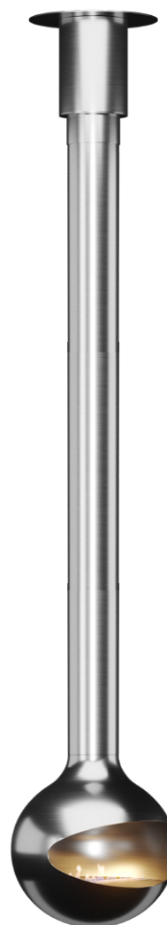
Brushed / Polished Stainless Steel