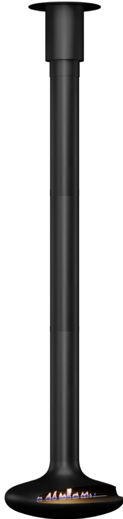
Black Powder Coat